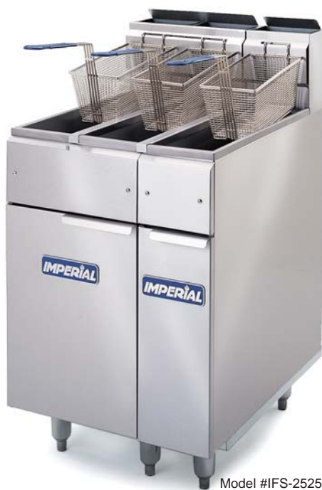
Model #IFS-2525 and Add-A-Fryer