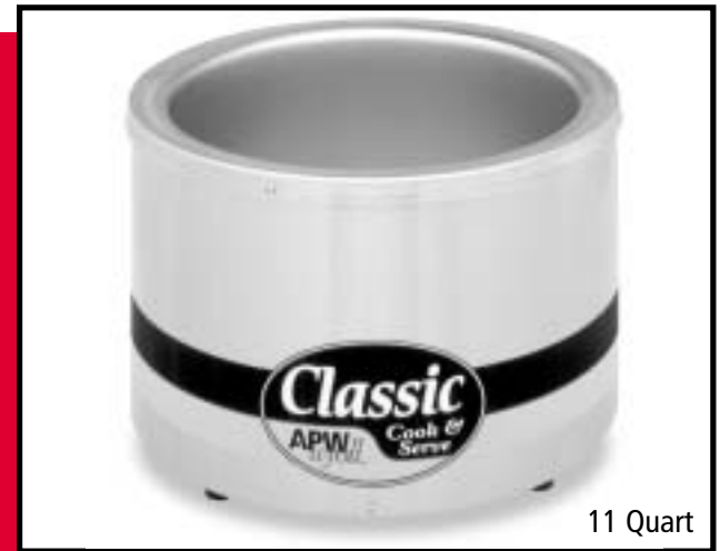
RCW-7 COUNTERTOP ROUND COOKER/WARMER